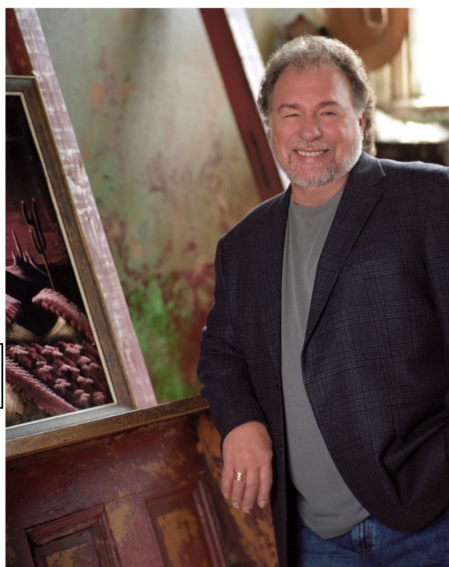
Gene Watson -->